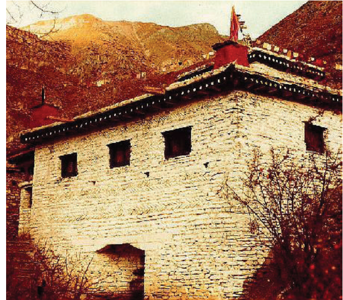
The "Temple Of Miraculous Fire" at Muktinath, Nepal.